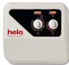
Roma II Control