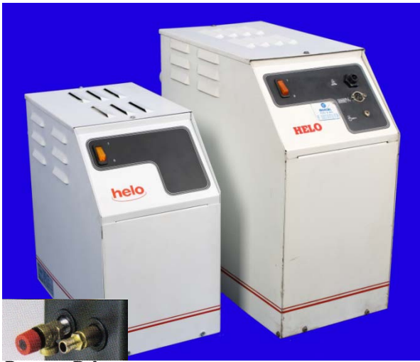
Pressure Release Valve

All of these steam generators have stainless steel boilers with Incalloy 825 elements for long life and high out steam. The supply water to the unit is electronically controlled with timer, solenoid valve, and water level cut-out probes to protect the heating elements. Steam safety control is complete with built-in 25 minute electronic timer and safety pressure release valve.