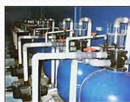
Fish Hatchery Filtration