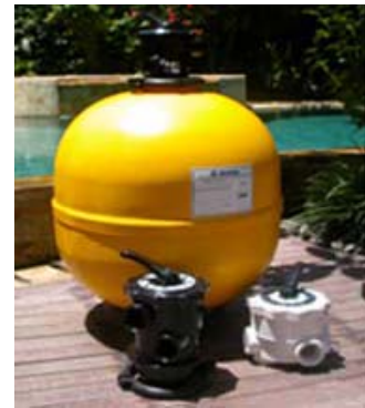
The FILTER made in Indonesia