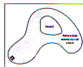
Single Ultrawave Head

Combining electromagnetic ultrawaves with beneficial bacteria and aeration (oxygen injected into water) will improve the pond water clearness, and fish lives more healthy.