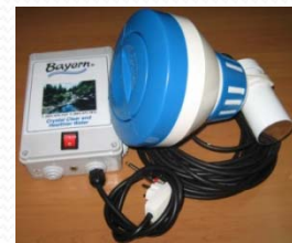
Algae Control with Controller

Bayern® Algae Control sends high frequency Pulse Electromagnetic Ultrawaves into the pond water. The electromagnetic ultrawaves will destroy organisms, such as algae, pathogen bacteria, virus, fungus, parasite, etc by a process called "cavitation" and by squeezing and releasing them in high frequency waves in water.