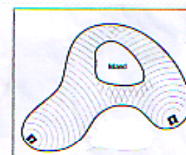
Two Ultrawave Heads

PT.MONCOL GOLFUSA,, Jakarta : Tel (021) 475-1127, Fax (021) 471-1972